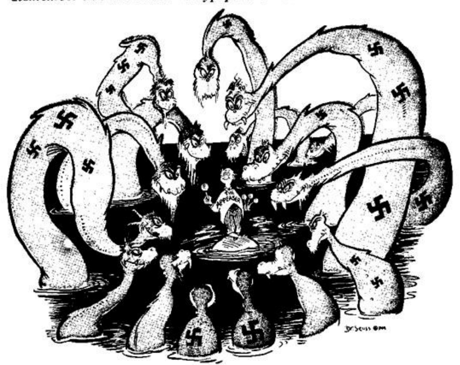
'Remember . . . One More Lollypop, and Then You All Go Home!'