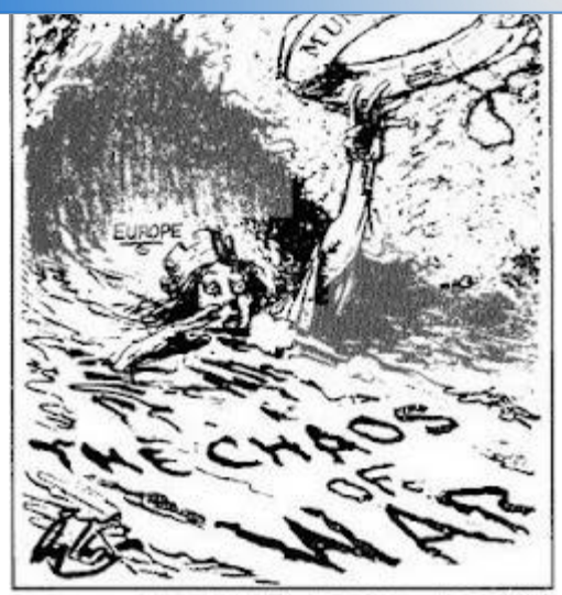
Evening Public Ledger, Philadelphia — October 2, 1938