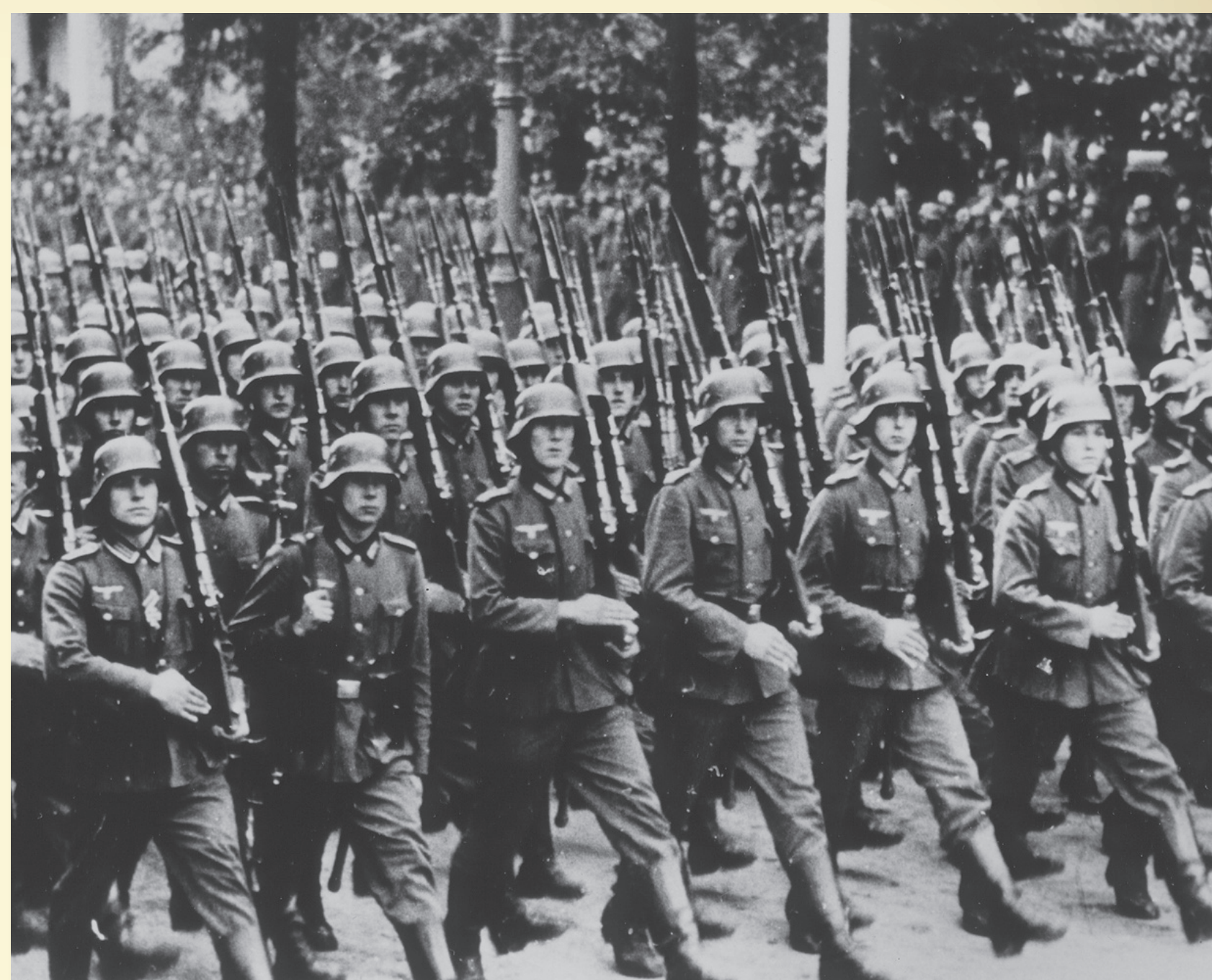
German soldiers march into Warsaw carrying bayonets. October 5, 1939.

In less than three years, Germany gained control of Europe and began the process of separating all Jews, Gypsies and other “non-desirables” from the general population.